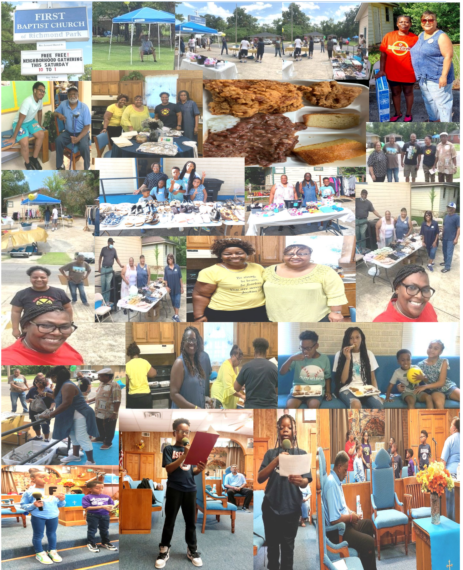
FBC COMMUNITY OUTREACH EVENT 9/16 & YOUTH DAY SERVICE 9/24